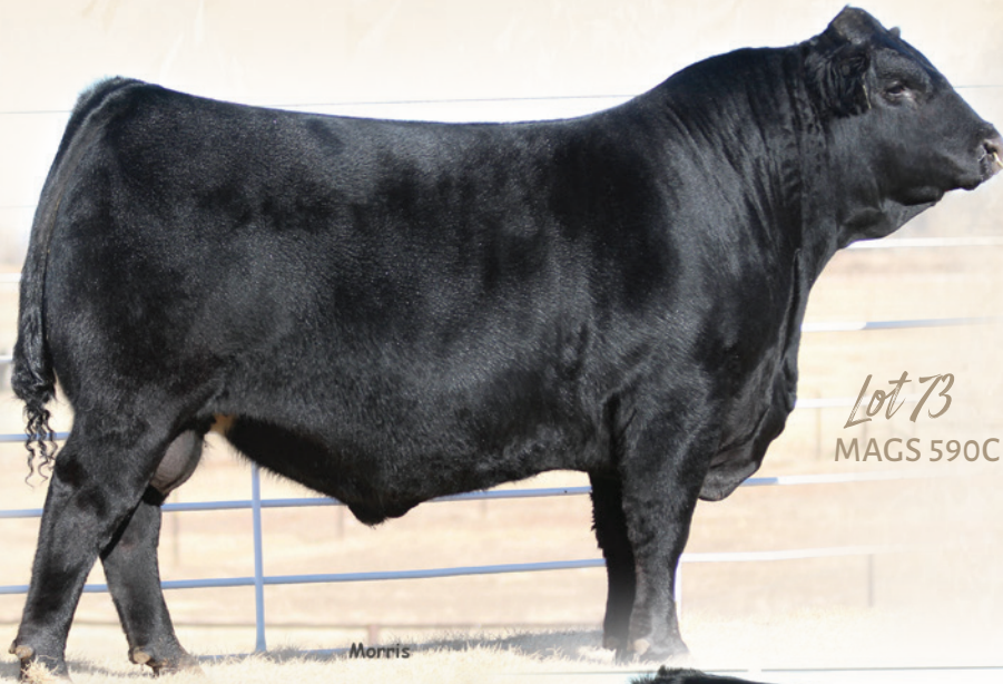
Lot 73 MAGS 590C