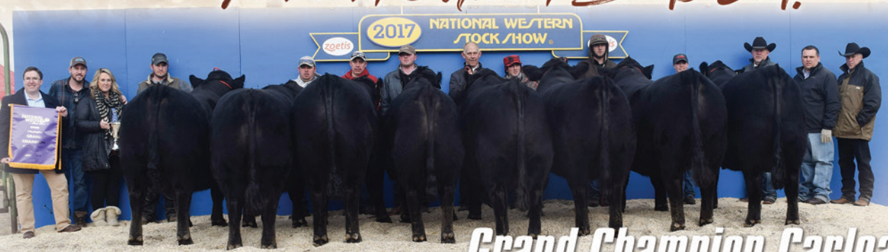
Grand Champion Carload