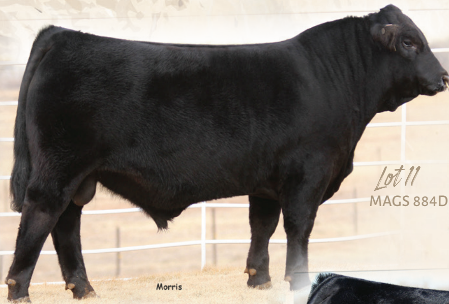
Lot 11 MAGS 884D