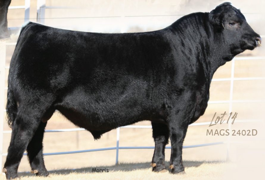
Lot 14 MAGS 2402D