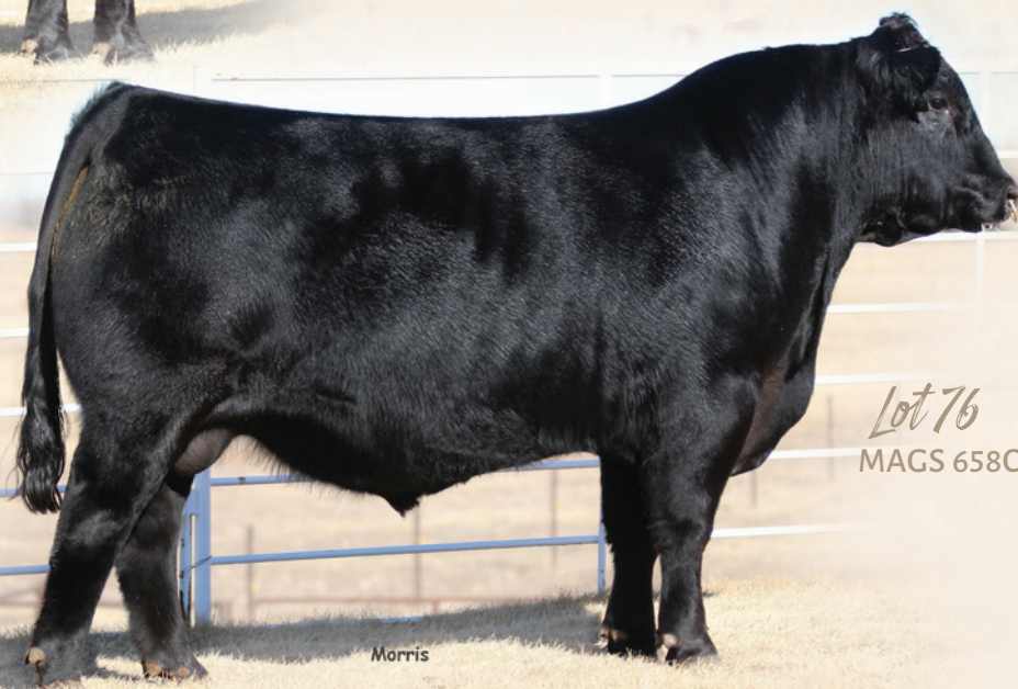
Lot 76 MAGS 658C