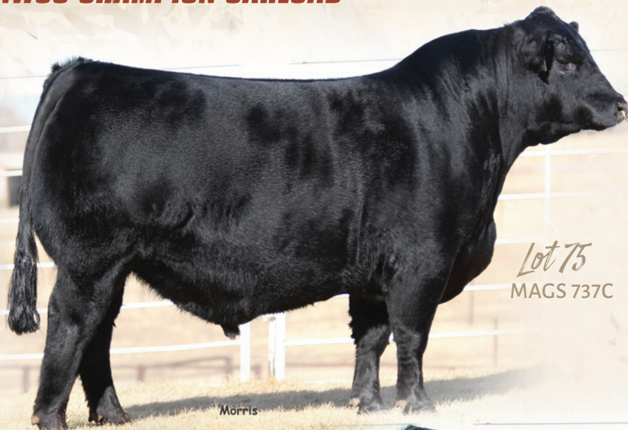
Lot 75 MAGS 737C