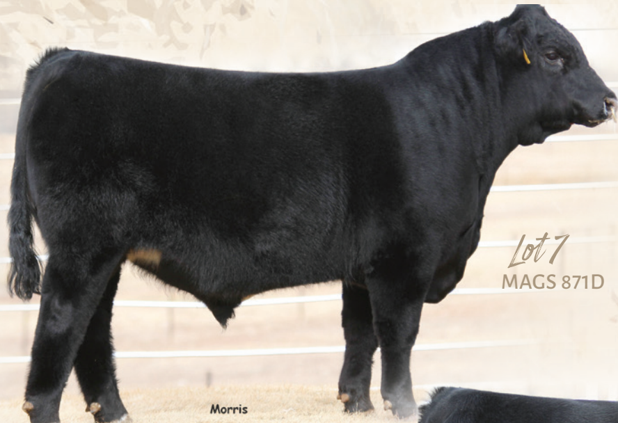
Lot 7 MAGS 871D