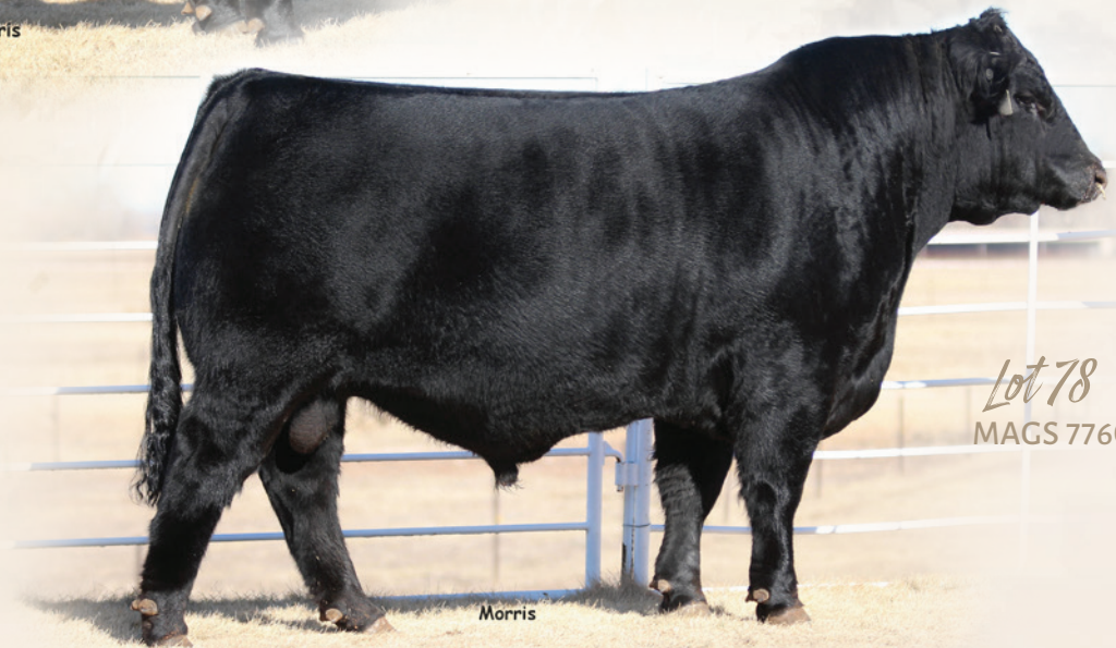
Lot 78 MAGS 776C