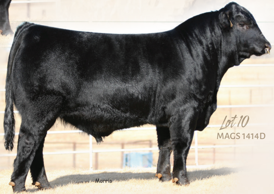
Lot 10 MAGS 1414D