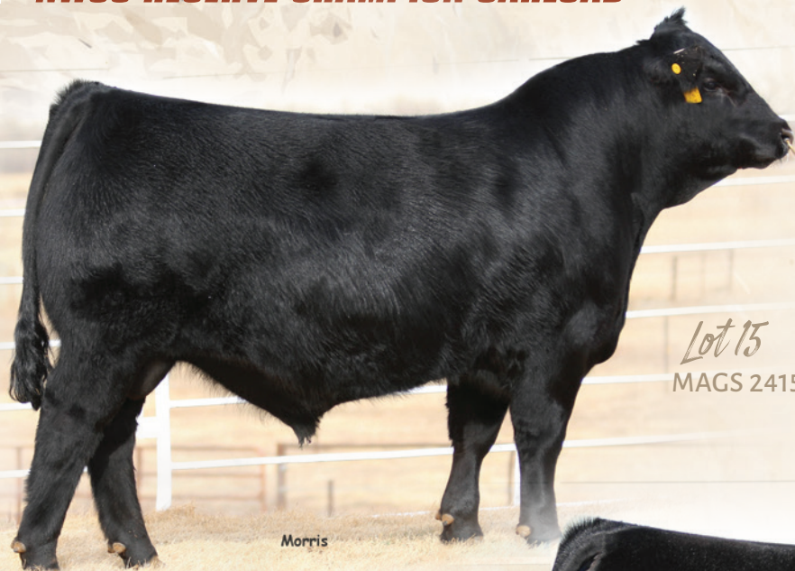
Lot 15 MAGS 2415D