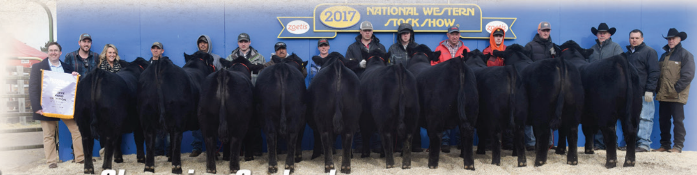
Reserve Champion Carload