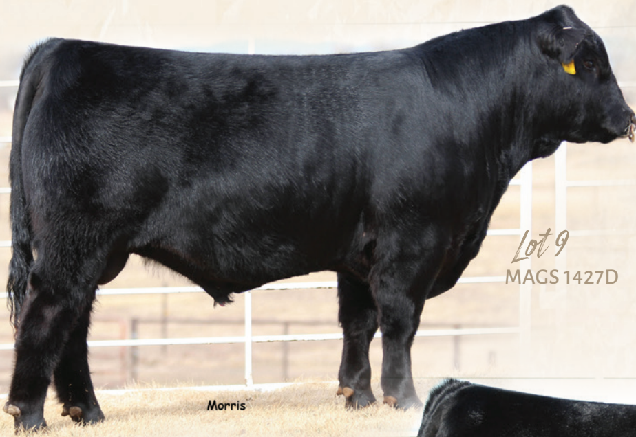
Lot 9 MAGS 1427D