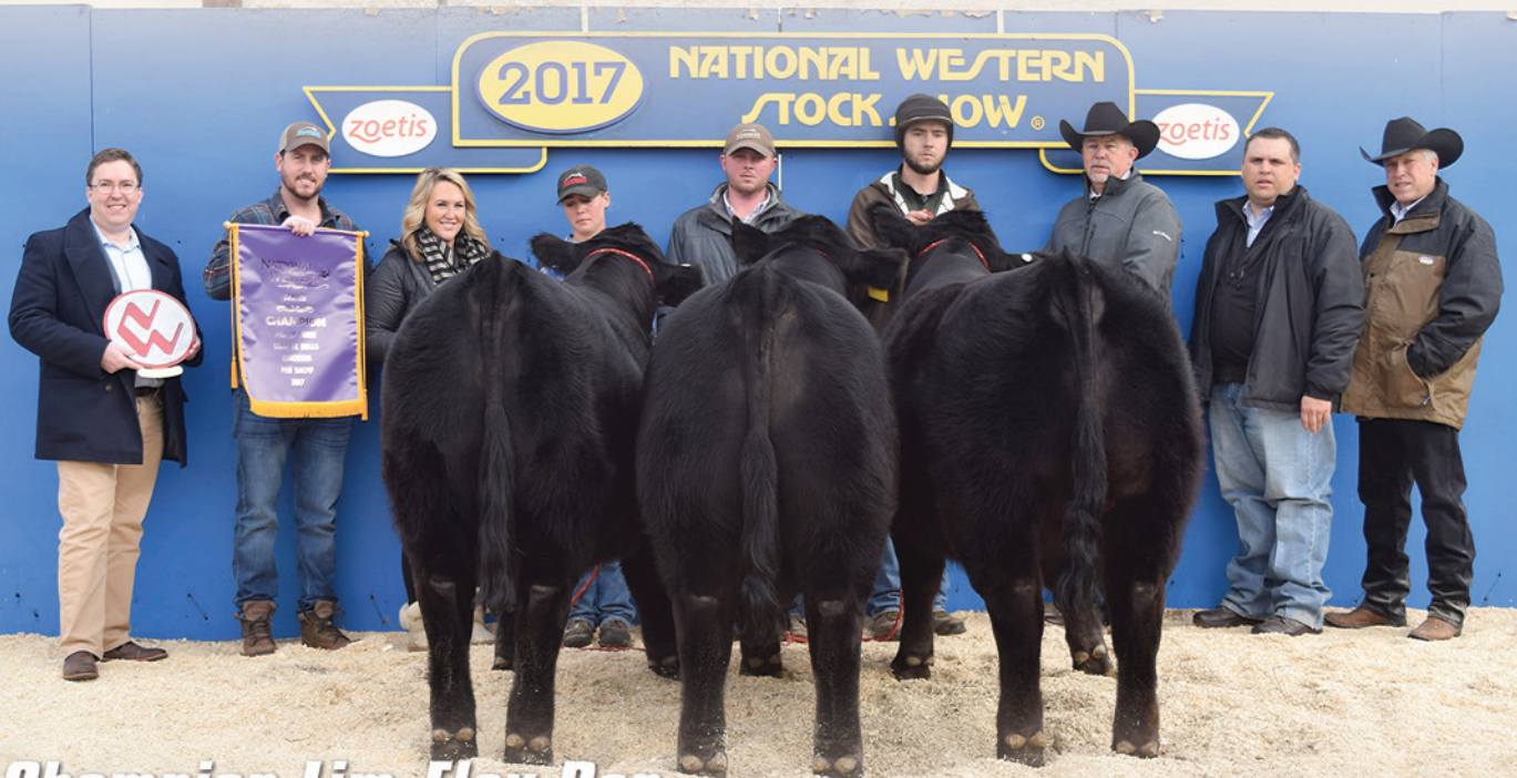
Champion Lim-Flex Pen AND PEOPLE'S CHOICE