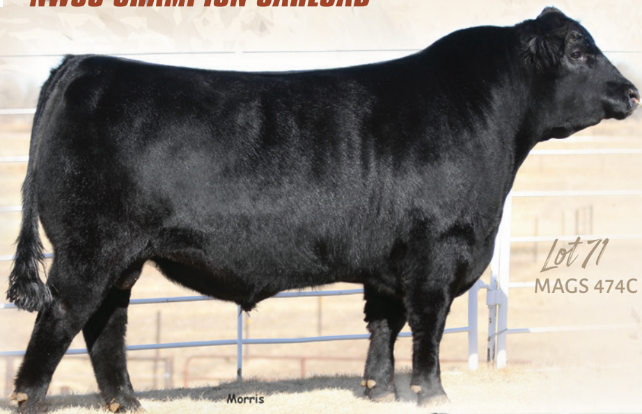
Lot 71 MAGS 474C