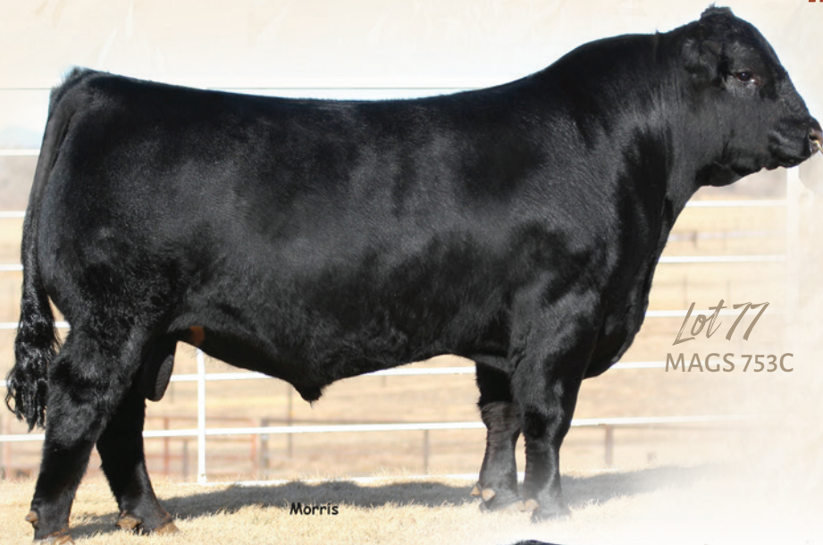
Lot 77 MAGS 753C