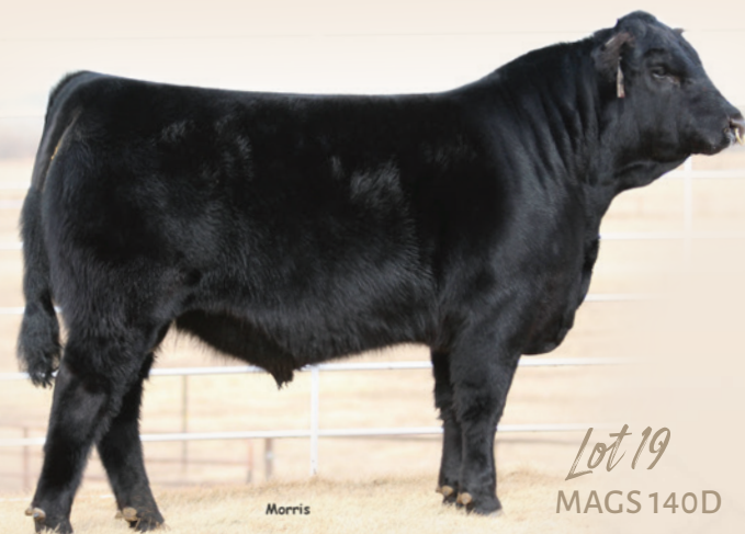
Lot 19 MAGS 140D

Sale day be sure to take a hard look at this high performing, stout featured, wide made half brother to lot 17. Visually, this homozygous polled herd sire prospect strikes you with an excellent combination of structural integrity, length of body and muscle shape. Numerically, he charts impressive growth performance and is highlighted by a mainstream terminal index figure which ranks in the top 2% of the entire breed.