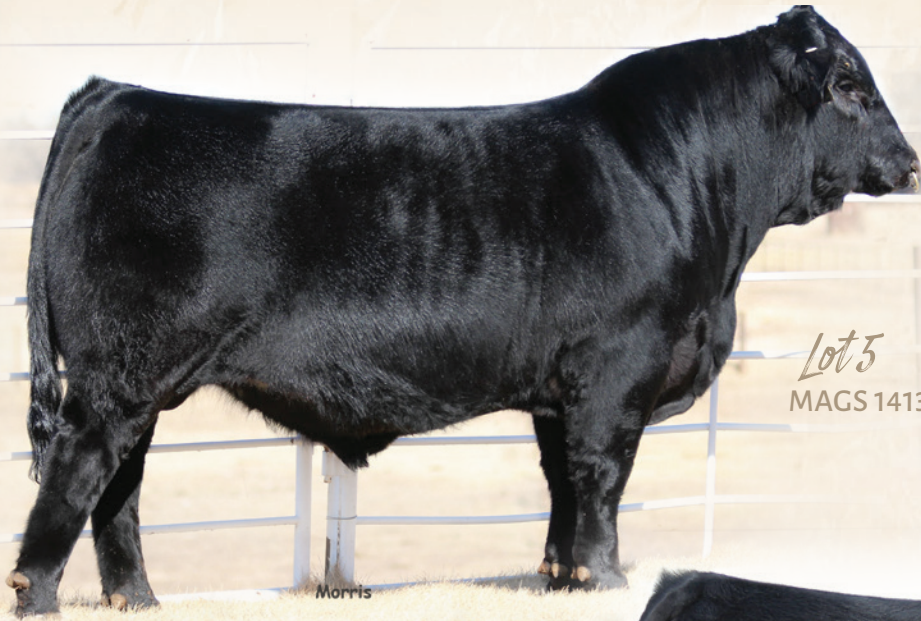
Lot 5 MAGS 1413D