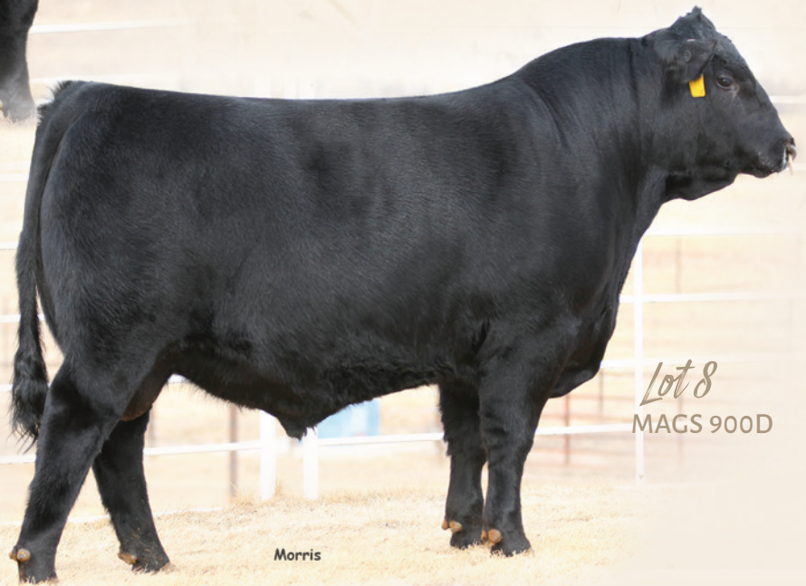
Lot 8 MAGS 900D