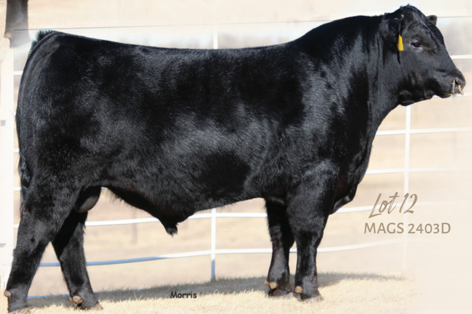
Lot 12 MAGS 2403D