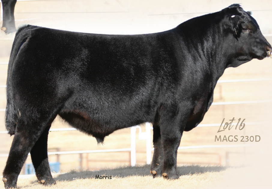
Lot 16 MAGS 230D