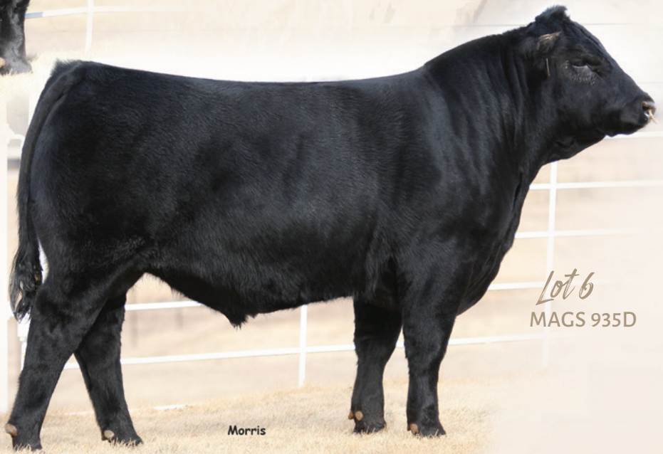
Lot 6 MAGS 935D