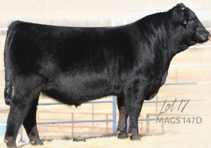
Lot 17 MAGS 147D