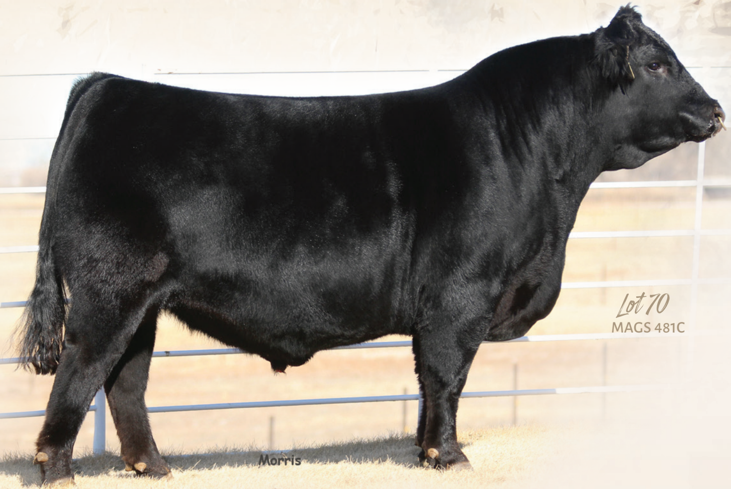
Lot 70 MAGS 481C