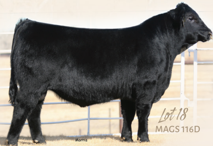
Lot 18 MAGS 116D

High quality is a fitting term for this double homozygous son of the elite, performance oriented A.I. sire Mags Eagle. Phenotypically, Dantel combines rib and muscle to the highest degree. Study the true rib shape through his center body and natural thickness he possesses, and we think you'll be impressed. Additionally, on paper he ranks in the top 10% for weaning, yearling and top 5% for marbling. Don't miss him sale day.