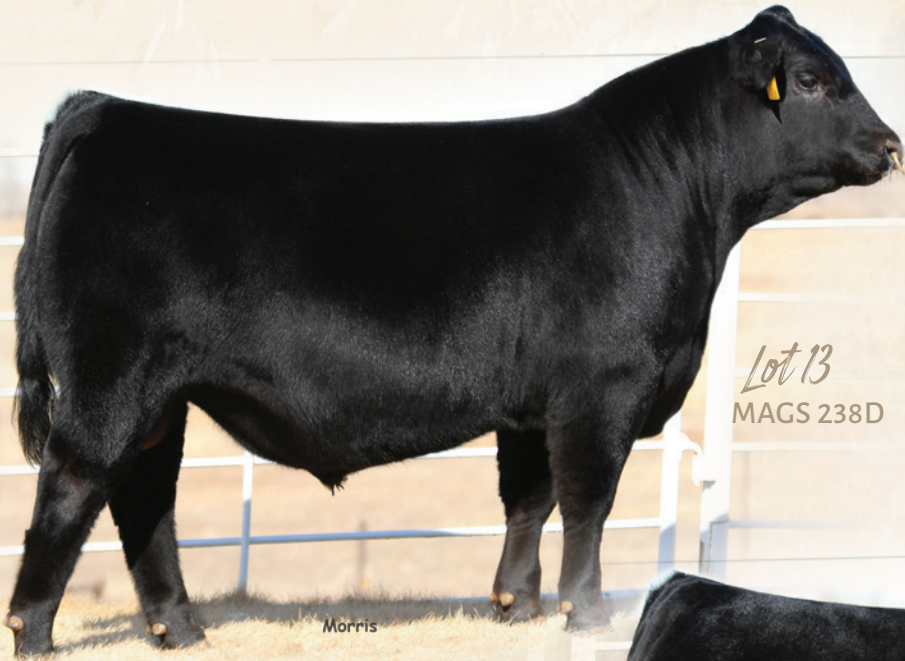
Lot 13 MAGS 238D