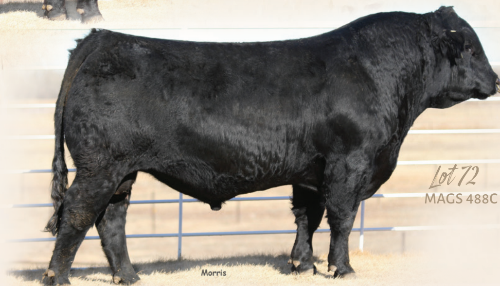
Lot 72 MAGS 488C