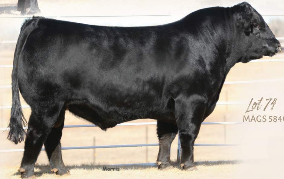
Lot 74 MAGS 584C